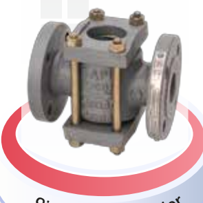
Sight Flow Indicator